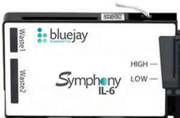
Figure X3. Photograph of the Symphony IL-6 Cartridge loaded with a whole blood specimen.

The disposable cartridge contains the reagents required to run the applicable test. The three steps of the test (sample preparation, chemical reaction, and detection) are performed in chambers present on the cartridge. All waste is collected in a chamber in the cartridge significantly reducing the risk of lab contamination that is often cited as a concern of molecular diagnostic testing. After the test is completed and the result is obtained, the cartridge is disposed of with the hospital's other medical waste.